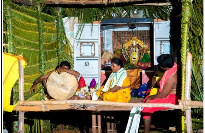
Yanadis worship activities of Lord Venkateswara