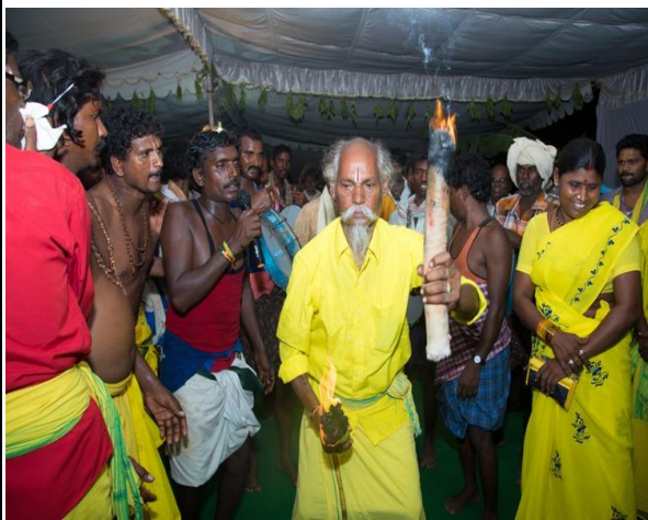
Religious activities of Yanadi