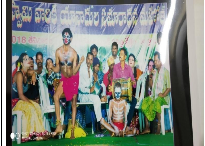
Cultural performance of Yanadis

In the day of celebration they execute their traditional and resorial, skills which are in practice from ancient to till date in the Domain of DTG of Yanadi even they are educated and colonised did not forget their culture which is transient from prior to present generation, it is a tremendous , Good 'stigma'. These cultural activities neither unconnected nor distasted even Bharth was invaded by no of foreigners who are disturbed traditional, cultural, ritual, socio-economic conditions, and all living conditions today the Hindusthani's following. So the Yanadis are either knowingly or un-knowingly safeguarding the Hinduism.