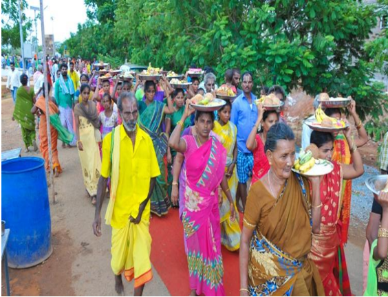
Yanadi devotees carrying their offerings